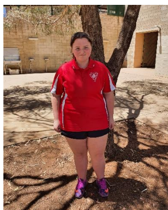
WHS Sport/PE polo shirt