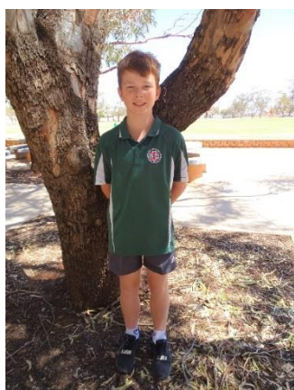
WHS Official polo shirt

The official uniform must be worn for official events such as school photographs, presentation night, graduation ceremonies and out of school activities where students are representing Willyama High School.