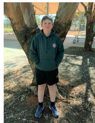
WHS Junior Hoodie