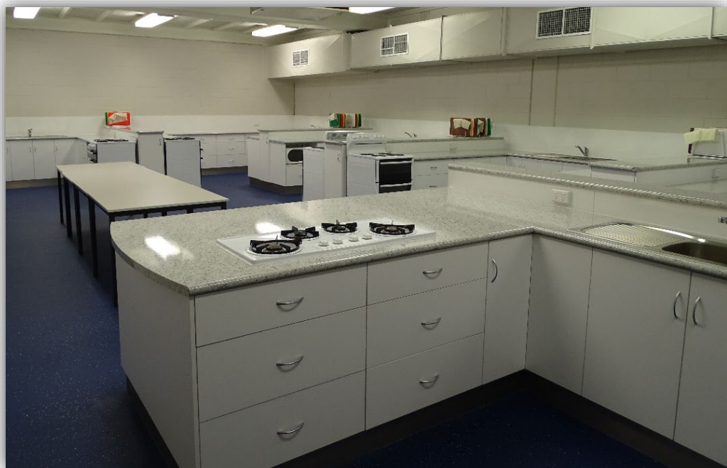
Recently renovated Food Technology Kitchen