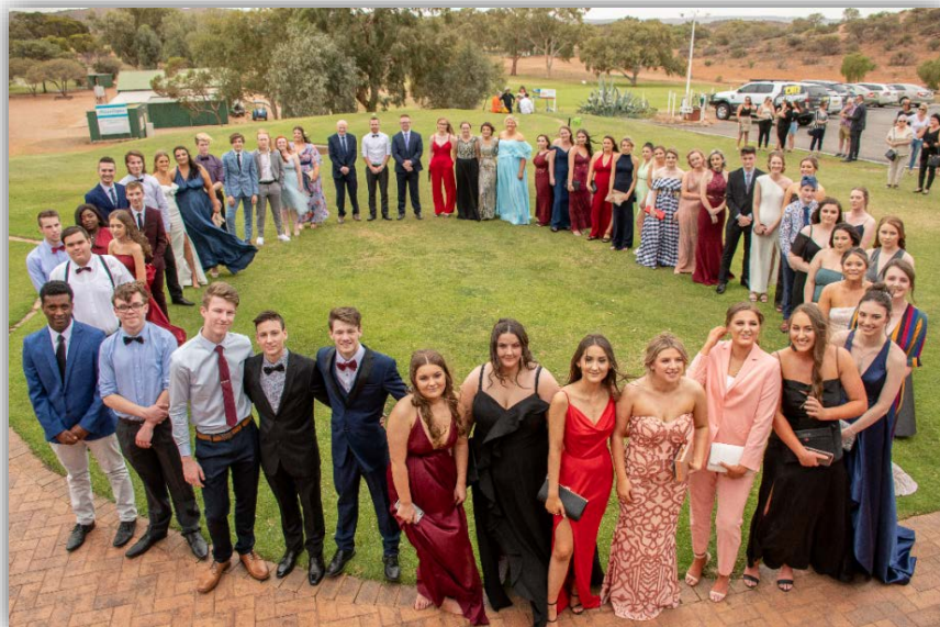
Year 12 Formal 2018