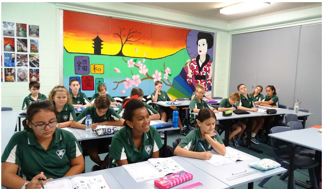
A Year 7 class enjoying their learning in Japanese