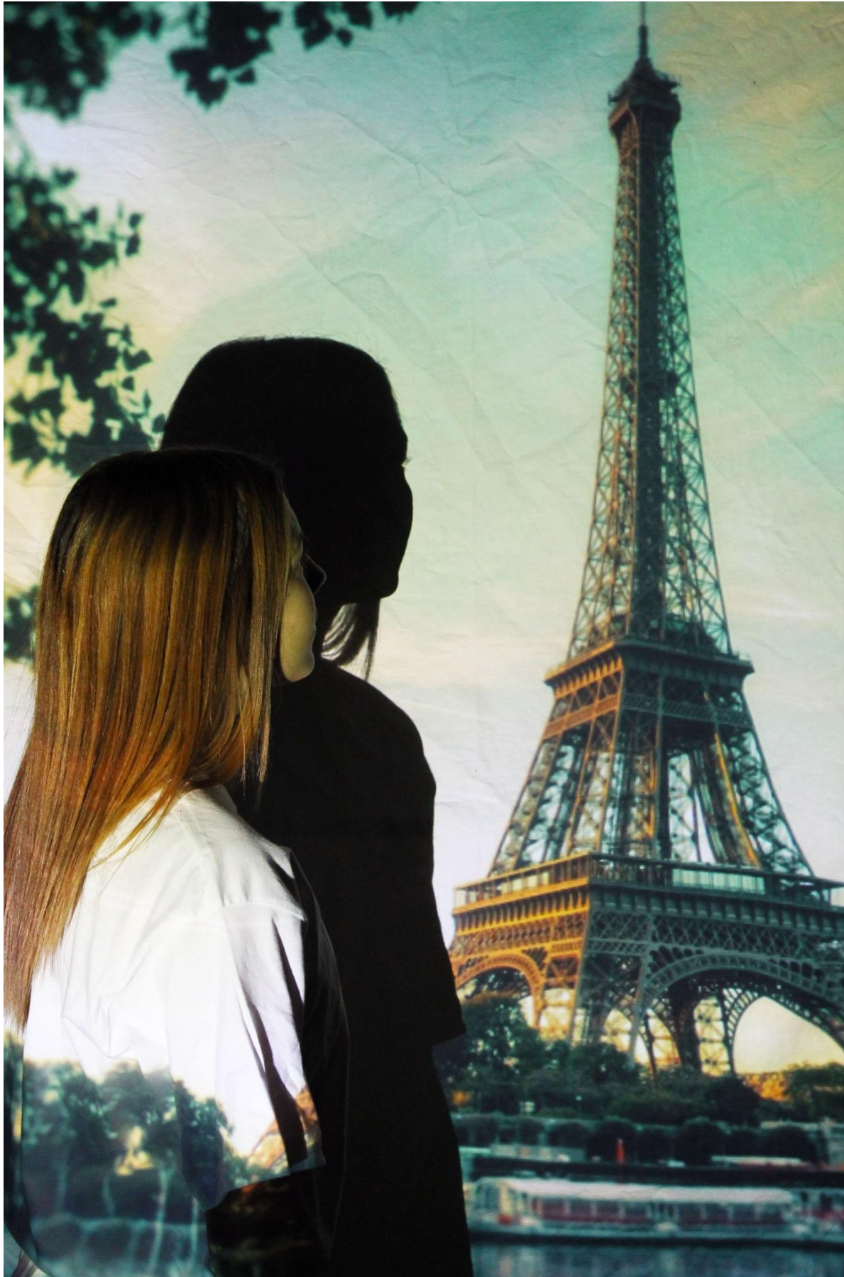
Year 10 Projection Photography

Phone: 08 8088 1055, Email: willyama-h.school@det.nsw.edu.au ,