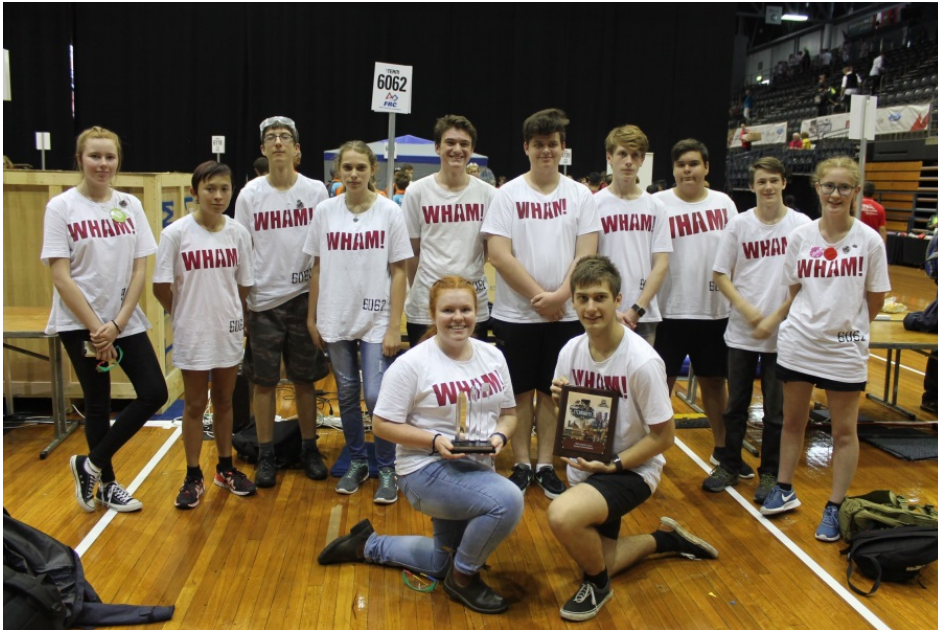
The WHAM! Team with the trophy for most creative design

Congratulations to the students who travelled to Sydney to compete in the First Robotics competition. Although the students did not come home with the win, Willyama's robot named Jitterbug, won the award for most creative design. For more information about the competition or to watch highlights visit: https://firstaustralia.org/programs/first-robotics-competition/