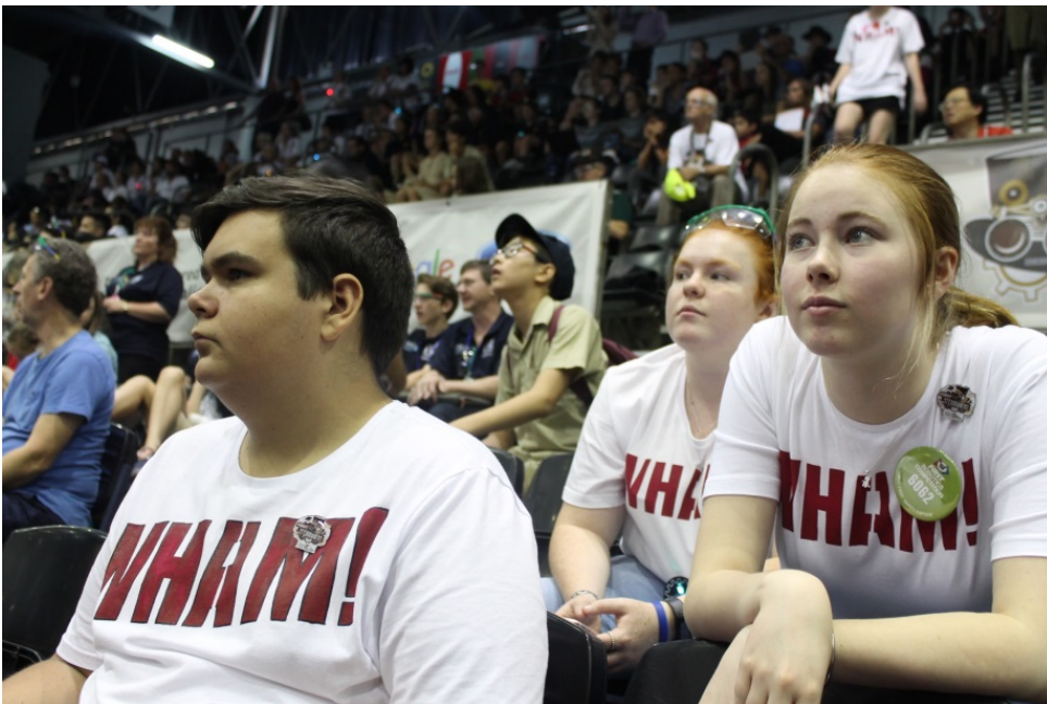
Team Members watching the competition