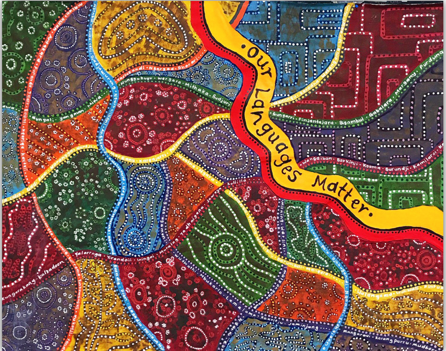
NAIDOC Week Banner

Web: http://www.willyama-h.schools.nsw.edu.au