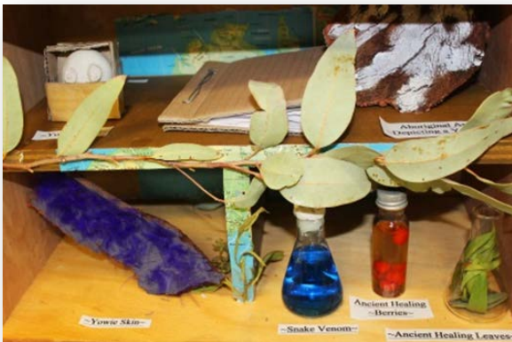
Deklin Langdon's Cabinet: Australia