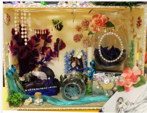
Caitlin Attrill's Cabinet: Mermaids