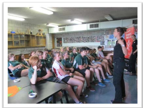
Year 10 Science and Engineering team get pointers for this year's Cobar competition