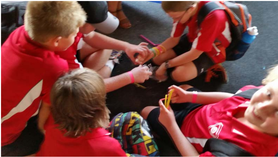
Students building a 'support network'

On Thursday 25 February, Willyama High School Year 7 students and Year 10 Peer Support Leaders joined with Broken Hill High School students to attend a wellbeing information day at the Race Course. Students participated in activities with several community organisations focusing on leadership, team work, wellbeing and problem solving. It was a successful day and the students were praised by organisers for their participation and excellent behaviour.