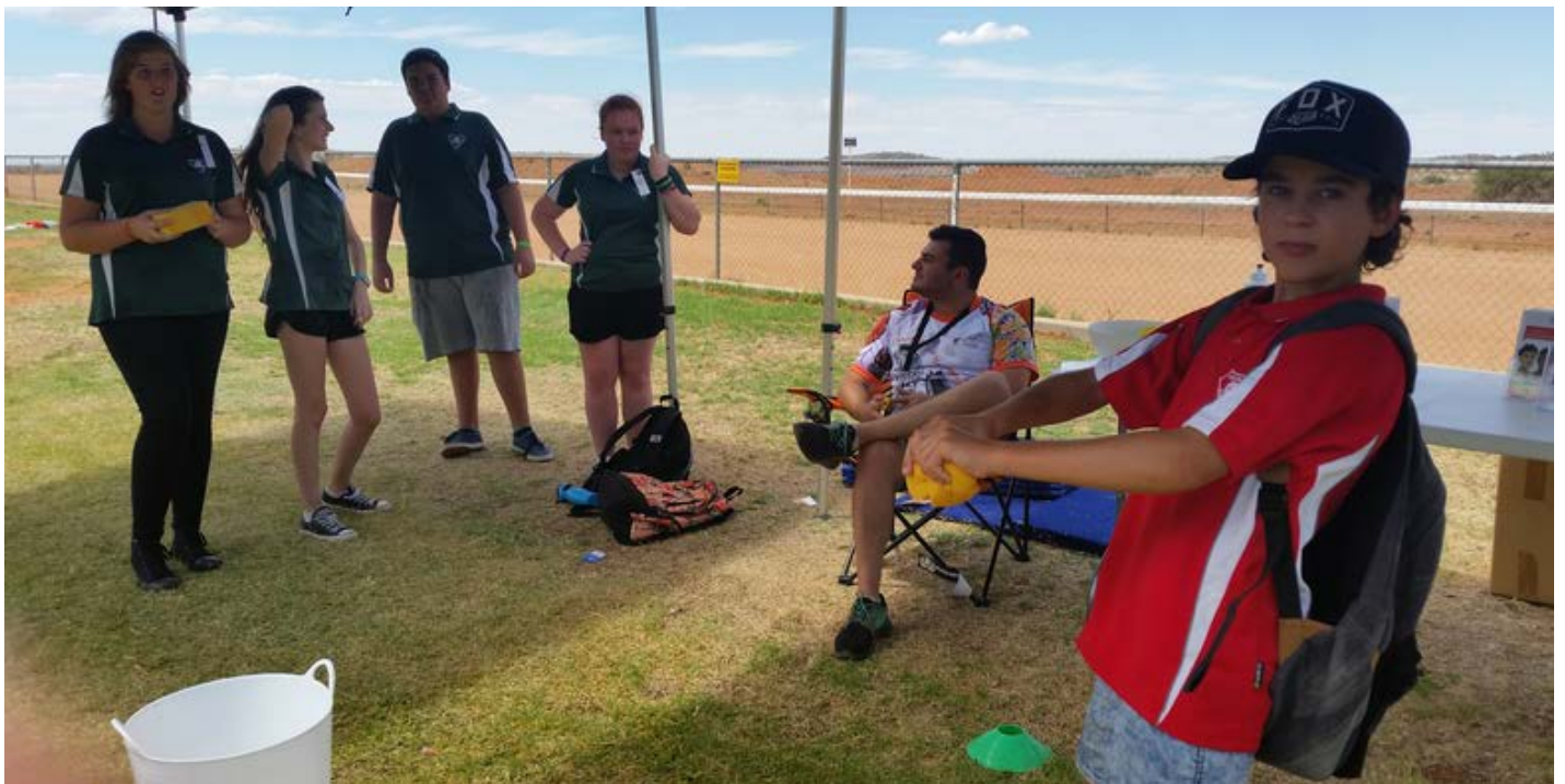
Maari Ma Youth Health