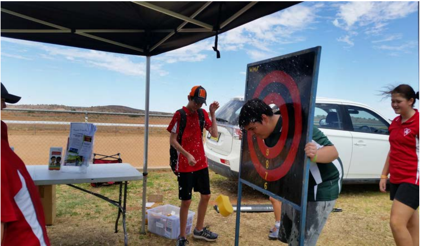
Students cooled off by throwing wet sponges at their peer support leaders at the Maari Ma Youth Health Tent