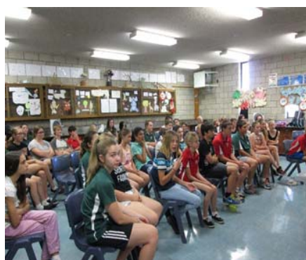
Year 7 watching the chemistry