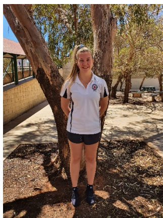
WHS Senior Shirt