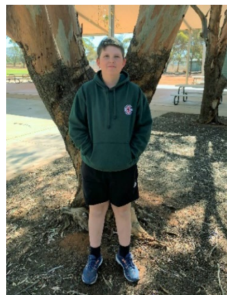
WHS Junior Hoodie