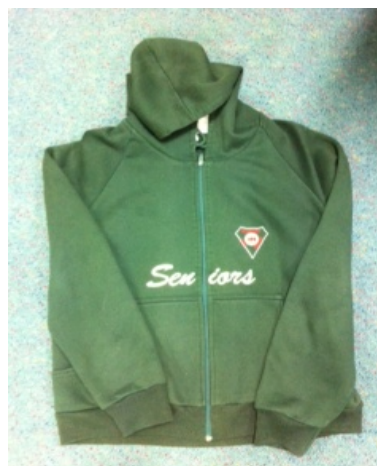
WHS Senior Hoodie