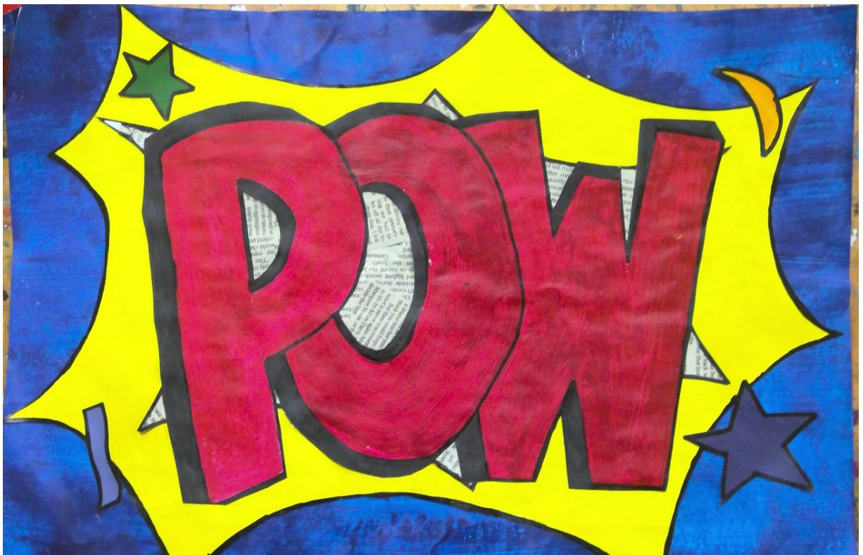
Saxon Locke (8)