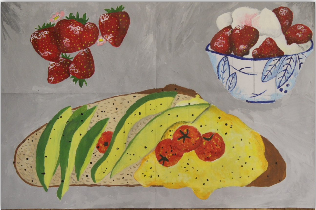
Chelsea Ward (9)