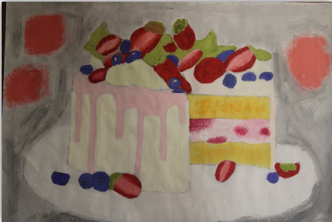
Demi Chrisakis (9)