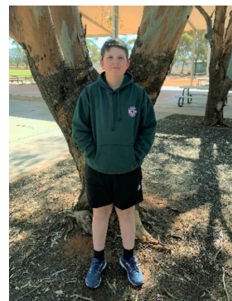
WHS Junior Hoodie