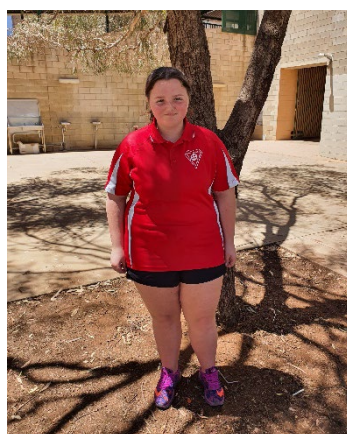
WHS Sport/PE polo shirt